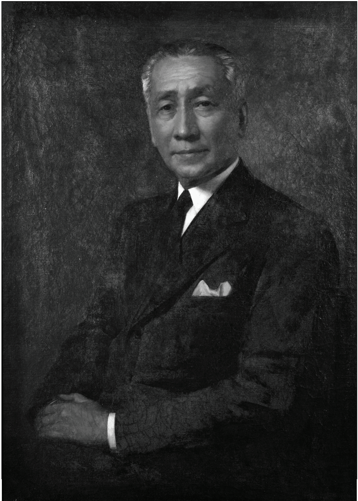
President Sergio Osmeña, Third President of the Philippines, Second President of the Commonwealth of the Philippines.